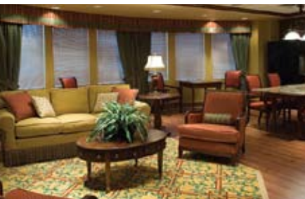
Third Floor Diracles Family Lounge