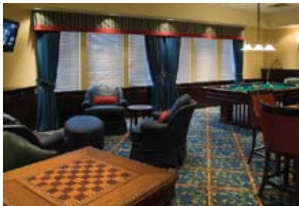
First Floor Game Room