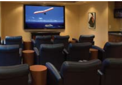
Second Floor Home Theatre

When you aren't enjoying the view from your room, you can take advantage of the many common areas we offer. In addition to the dining areas, library, gardens and other open spaces, our new Assisted Living apartments in West Hall feature a game room, theatre and family lounge.